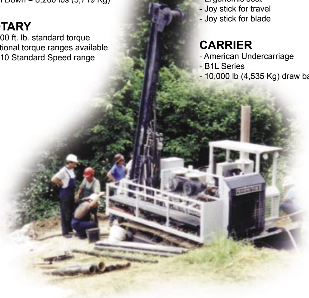
The Prospector II working in Slovakia