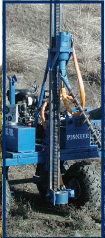
Specialty & Multi-Purpose